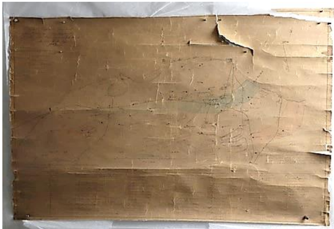
Photograph of Martin's geological map in 2023 (ELGNM:1978.339) showing the paper peeling away from the backing and the tears and creases caused by decades of storage in less than perfect conditions.

Drawn in gall ink and graphite pencil on linen-backed paper, the map was faded and in need of urgent conservation to prevent further deterioration. Experts at the Scottish Conservation Studio at Hopetoun House, Edinburgh, stabilised it but it remains too fragile to display. This contrast-enhanced photograph allows the information to be shared without the need to refer to Martin's original map.