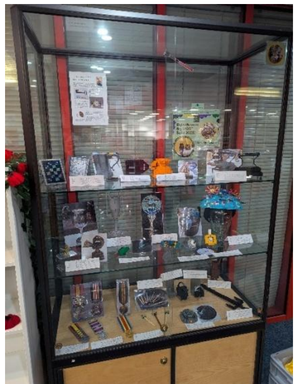
Replica objects on display at No 3 High St and Elgin Library