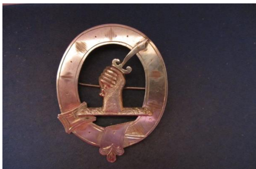
Clan badge by James Thompson MacKay II Punched on back: JTM in gothic script and ELGIN Can anyone identify the clan?