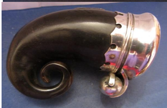
Snuff mull possibly by Alexander & Charles Fowler with later inscription 'FROM R.F. TO A. SIMPSON 1900 Punched on inside of lid ACF ACF Who is R.F. ? Who is A. Simpson?