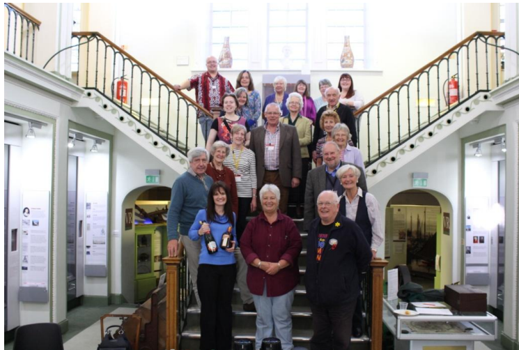
Some of the volunteers who attended the end of season Thank you party