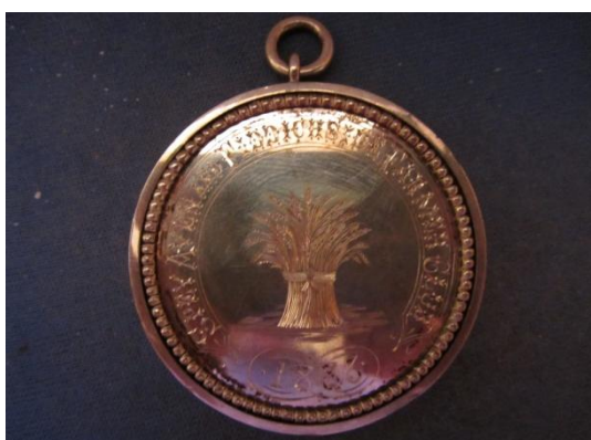
Medal of SPEY AVEN AND FIDDICHSIDE FARMER CLUB 1883 by James Thompson MacKay II NO ENGRAVING ON BACK Punched on bottom of base MACKAY ELGIN Any suggestion for what it was issued?