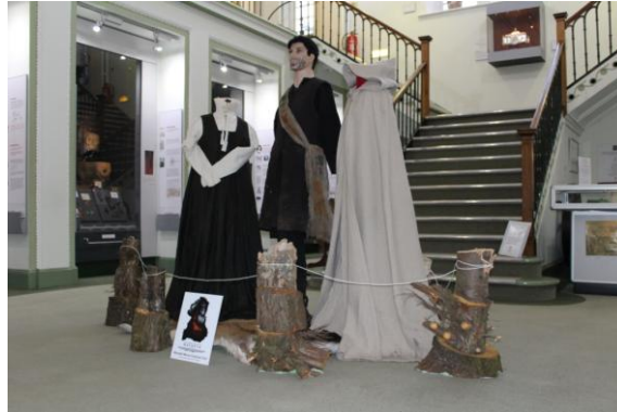
Held in the Museum recently was a display of costumes from the recently released film of Macbeth