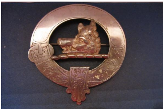
Clan badge possibly by Alexander & Charles Fowler Punched on back: ACF Can anyone identify the clan?