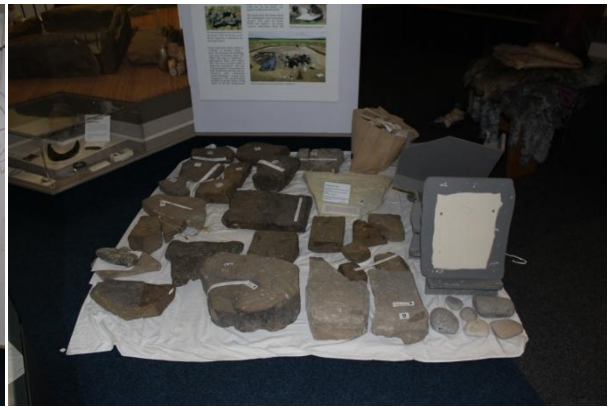
The rear gallery being readied for the Dandaleith Stone and the new 'Stones' display.