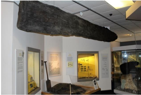
The Spey log boat finally in place in the rear gallery above the Spey coracle