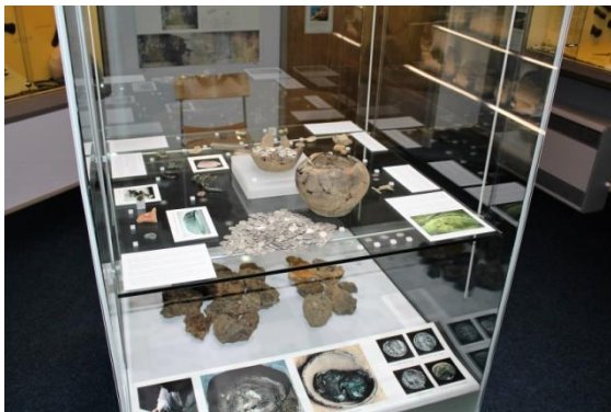
The Birnie hoard back in position after a year of research at National Museums Scotland