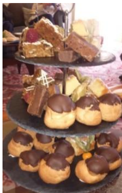
Before and after cake

The morning of Di's last day on the 28 th March 2017, was somewhat poignant; we spent it crawling around on our knees, unfurling, packing and re rolling one of the earliest Trade banners, keeping a close eye on woodworm holes and a long dead wood louse. By the time her leaving do in the Mansion House came around, we were more than ready for cake.