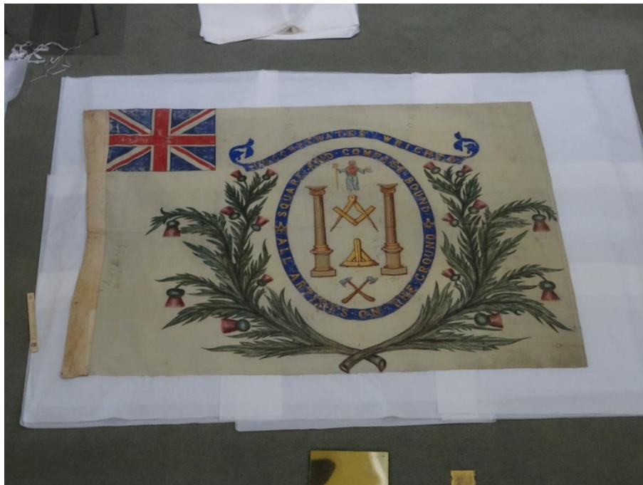
The Squarewrights' Banner

Finally...I would like to let you all know that I am moving on, well actually I'm moving to Yorkshire! By the time you read this I will be knee deep in packing cases and tissue paper wrapping up my household items – not Trades Banners – for a move to Catterick. I would like to take this opportunity to thank everyone with whom I have worked over the last four years and everyone who has supported the families activities.