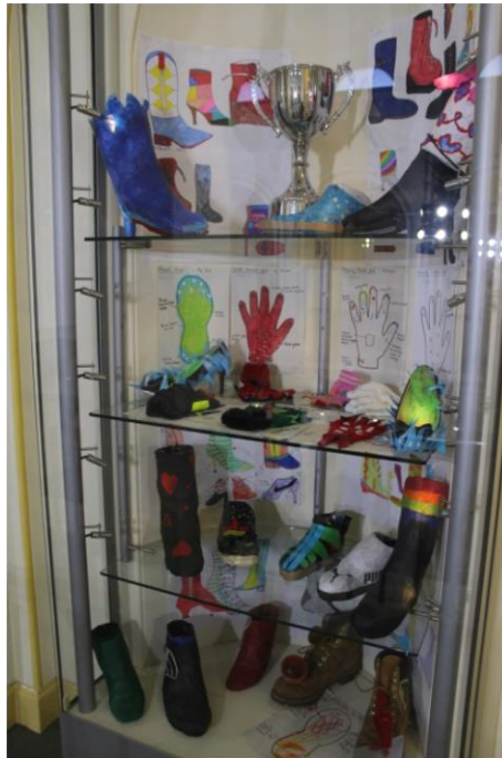
The Schools' Competition Display Case

There are a number of events and activities planned for this year and we are looking for as much help as possible. If you feel that you can help out with these then please get in touch with the museum – there is a sheet on the noticeboard in the office where you can sign up.