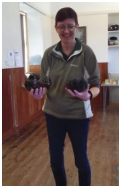
The last road trip – Findochty BALL group handling session 2017