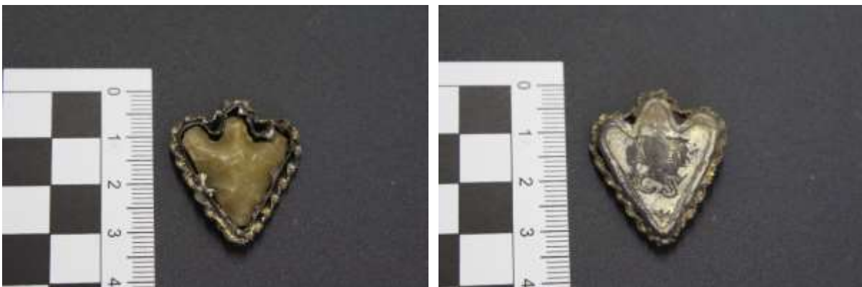
Item 4. Neolithic arrowhead in probable Post Medieval silver frame, from Dufftown TT132/22