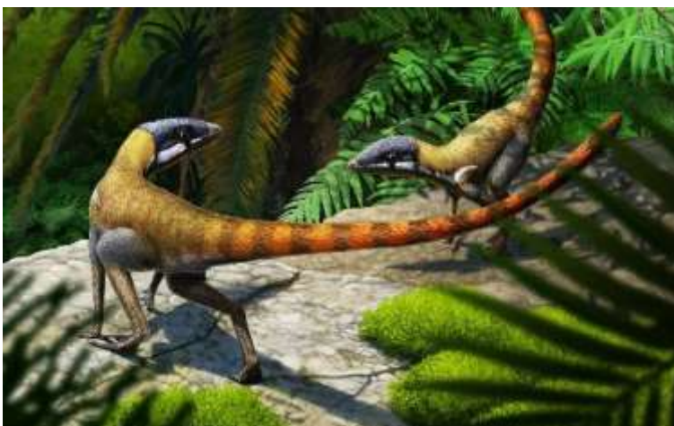
A reconstruction by professional palaeoartist Gabriel Ugueto, showing what these animals might have looked like, although the desert environment ~ 227 million-years-ago in Moray would not have supported such lush greenery!