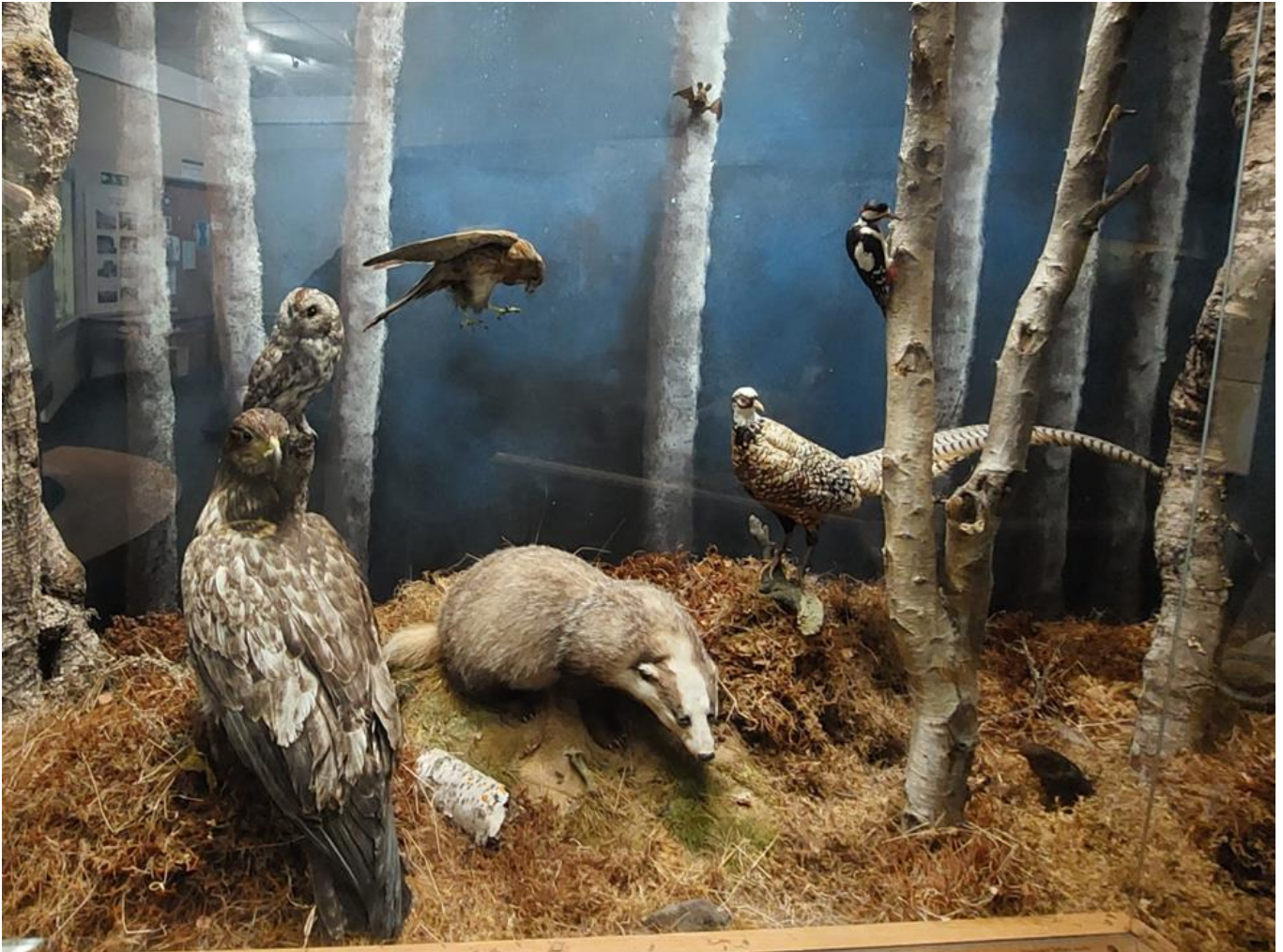
From L-R: Golden eagle; Tawny owl; Kestrel; Badger; Long-eared bat; Reeve's pheasant; Great-spotted woodpecker

The Natural History Layout comprises amphibians, birds, insects, and mammals depicted in a woodland diorama; most of the creatures are native to Scotland and were collected and prepared during the late 19th and early 20th Centuries. Taxidermy of specimens allowed people to see their native fauna (and more exotic species) in a time before wildlife photography and digital imagery made these animals familiar to all. Today, some of these creatures, such as the wild cat and the capercaillie, are threatened with extinction as human activity encroaches upon their natural habitat. This makes it even more important that natural history specimens are used to educate people about the environment.