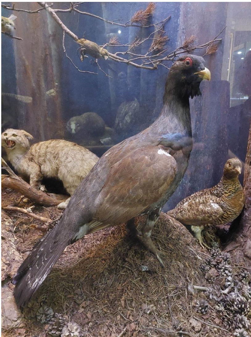
Male and female capercaillie; wild cat behind and crossbill in the tree