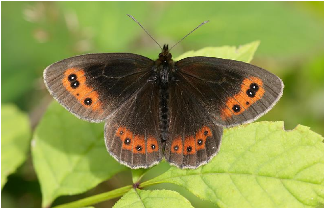
Scotch argus butterfly ( https://www.ukbutterflies.co.uk/species.php?species=aethiops )

Emperor moth (ELGNM: 1930.10.195.1/12) Kentish glory moth (ELGNM: 1930.10.194.1/12) Oak eggar moth (ELGNM: 1930.10.196.1/12) Orange tip butterfly (ELGNM: 1930.10.59.1/5) Pearl bordered fritillary butterfly (ELGNM: 1930.10.7.1/1) Pebble hook (tip) moth (ELGNM: 1930.10.201.1/12) Pine hawk moth (ELGNM collection) Scotch argus butterfly (ELGNM: 1930.10.28.1/3) Speckled wood butterfly (ELGNM: 1930.10.29.1/3) Speckled yellow moth (ELGNM: 1978.829.281.5/16) Wood tiger moth (ELGNM: 1930.10.153.1/10) Wood wasp (ELGNM: 1930.10.95.1/8)