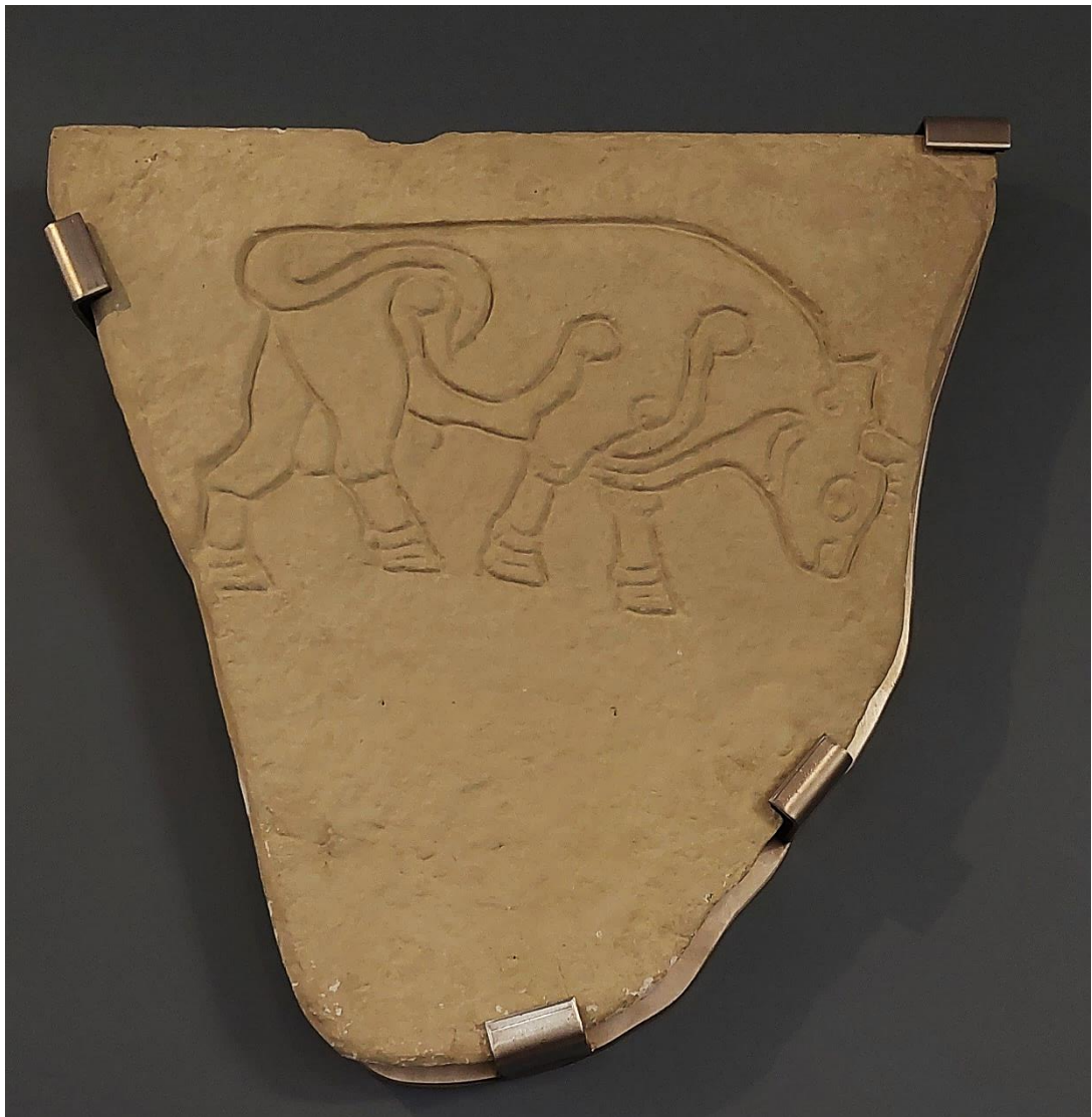
Cast showing one of the Burghead Bulls carved on a Pictish symbol stone (ELGNM: 1892.1 (Burghead 5))