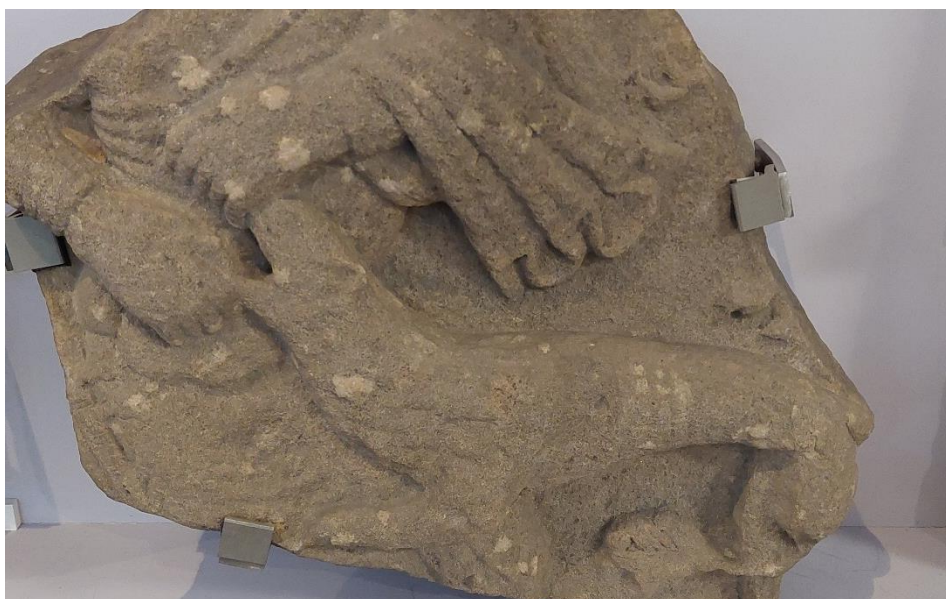
Hands prising apart the jaws of a lion on an early Christian symbol stone (ELGNM:1855.1.14 (Drainie 16))